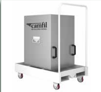
Camfil APC transport carriage